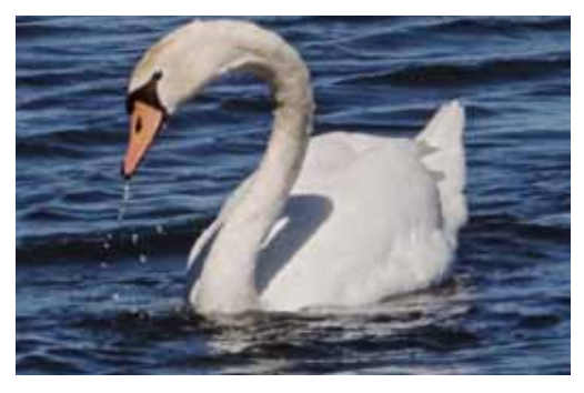
Ugly Duckling or Beautiful Swan?

contact GLC at 337-5476 director@GratiotLakeConservancy.org Snacks provided:)