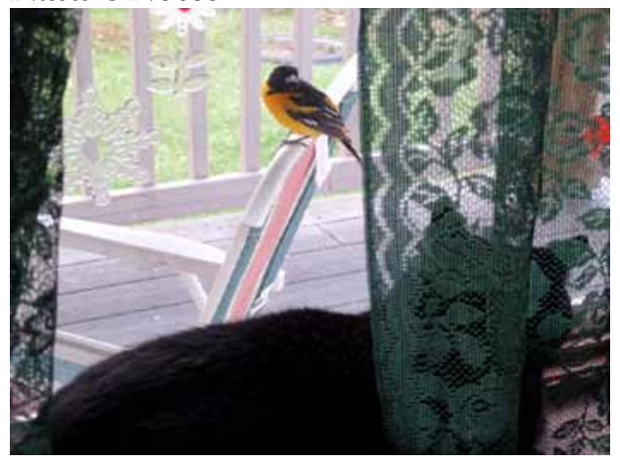
Are Lily the cat and this Baltimore oriole friends? Find out on page 7.