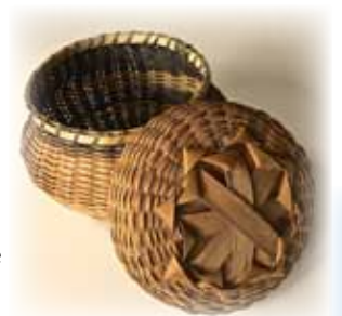
Ojibwe Sewing Basket crafted from black ash wood

Innumerable beneficial interactions have developed over time between the flora and the peoples living on the land in the Keweenaw. Berries, seeds, roots, and leaves provide an integral part of our diet. Medicines to heal our ills can be extracted from other plants. Shelter, baskets, and tools can be crafted from the fibers of other plants. And we can't help but acknowledge that the exquisite beauty of many flowers simply enrich our lives.