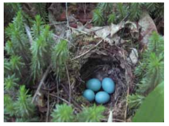
Janet photographed this clutch of blue eggs (likely Hermit Thrush or Veery) at the GLC Preserve. The nest was so well hidden amid club moss and leaves that we nearly stepped on it!

About 11% of the plant species found on GLC land at Gratiot Lake were not native to the area. <u>Most</u> of these alien plants were found in disturbed areas such as roadsides, in areas where buildings or trailers had been, or near the Noblet Field Station. Most non-native species present do not pose much risk of disturbing more pristine native plant communities. However, some of the