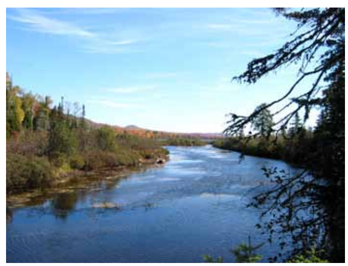
Little Gratiot River